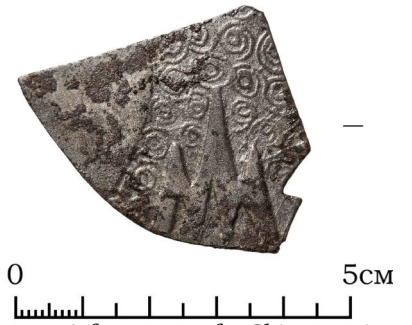
Fig. 38. A fragment of a Chinese mirror, from grave AT1/2.

but rather their local copies [Fig. 37]. In four instances mirrors were found which date to the pre-Han period in China [Figs. 38-39], i.e., to the end of