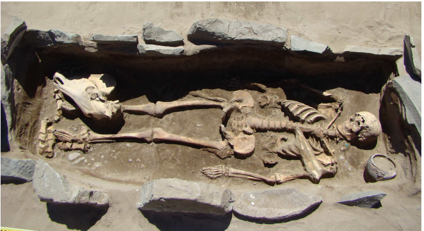
Fig. 10. The male grave AT1/46, with a horse skull, in a wooden coffin with stone siding.

Without question, the chief element of the female burial array is the belt, whose central detail in many cases is a large openwork buckle or belt plaque made of bronze with zoomorphic and geometric ornament [Fig. 14] or a belt plaque of jet, decorated with engravings or inlays of semi-precious stones [Fig. 15]. Also found are engraved bone buckle-plaques. The belts themselves, whose main material was leather or textile, were deco-