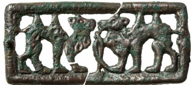
Fig. 26. A bronze openwork buckle depicting two camels, from grave AT1/21.