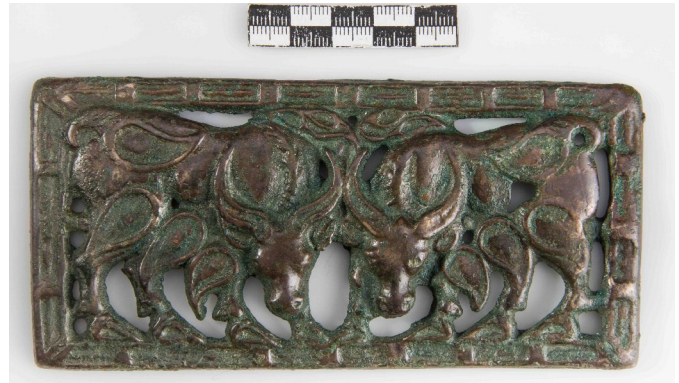
Fig. 24. A bronze openwork buckle depicting two bulls or yaks, from grave T/13.