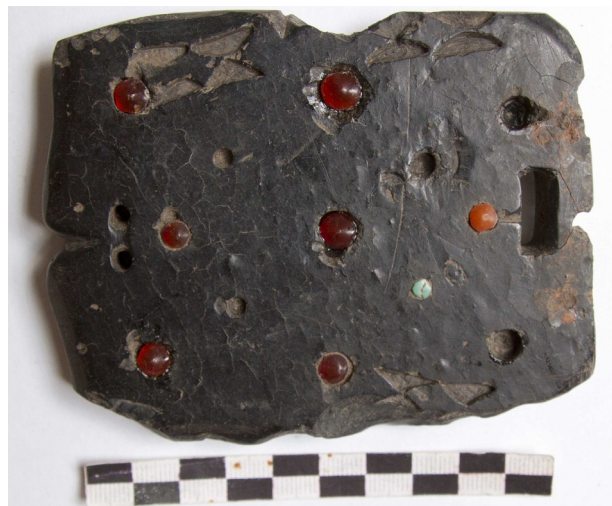
Fig. 32. A large jet buckle with inlay, from grave AT1/35.