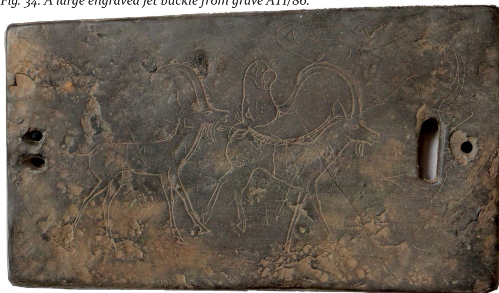
Fig. 34. A large engraved jet buckle from grave AT1/86.

man. Above one of the goats is an image of a horse lying upside down and with a twisted croup. In this way, elements of the Scythian animal style were combined with the Xiongnu pictorial tradition [Fig. 34]. On the belt of a young woman from grave T/21 was a jet buckle plaque engraved with a tamgha -like symbol resembling an hour-glass or Wu symbol as seen in Chinese Wu Zhu 五銖 coins. A jar-shaped vessel set in that grave is analogous to one from grave AT1/86. The small belt appliqués measure 4-5 x 2.5-3 cm. On both