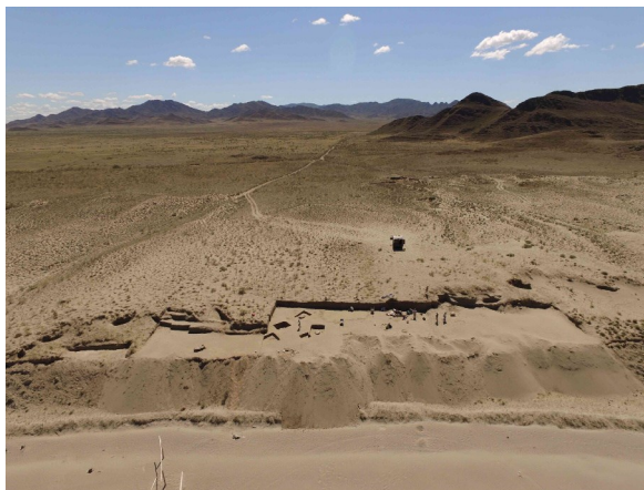
Fig. 6. Excavations of the Terezin cemetery.

Historical information about the social structure of Xiongnu society is known in the first instance from Chinese written sources. An important supplement to them is the material from archaeological excavations on the territory occupied by Xiongnu culture, in the first instance both the elite tombs and the unlooted ordinary burials. A number of the assertions of the Chinese historiographers