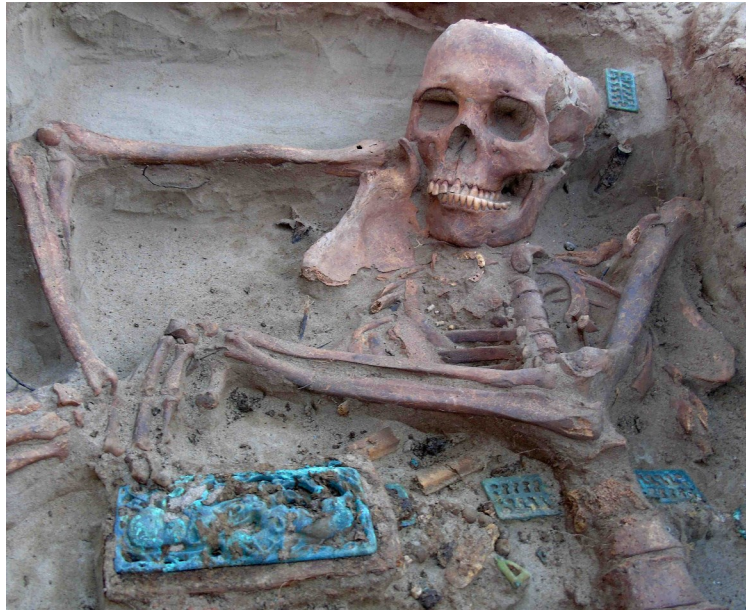
Fig. 49. Detail of a belt in the female burial T/31.

Who were the people buried at Ala-Tey and Terezin? So far one might propose that this was some group of nomads who were part of the multi-ethnic Xiongnu confederation and who had entered Tuva during their expansion to the north. Until then they might have lived somewhere on the northern borders of China, where they could obtain Chinese wares such as mirrors, coins, ornaments, etc.; after that they set off on the long march which brought them to Tuva. Once there, no longer having access to original Chinese objects, they had to copy them on their own: the majority of copies of the Chinese mirrors and openwork buckles are made of bronze, which was of local origin, as metallurgical analysis has demonstrated (Khavrin 2011; 2016). The time when these people headed into Tuva so far seems to have been the beginning of the Western Han period, i.e., the 2nd century BCE. Evidence for