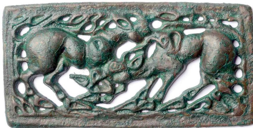
Fig. 28. A bronze openwork buckle depicting two horses in combat, from grave AT1/42.

8. A fragment of a bronze buckle depicting a horse [Fig. 27] in recumbent position, legs drawn under it (AT1/23, skeleton No. 2). It was on a belt along with unidentifiable fragments of another buckle. Several similar buckles with a single horse whose legs are drawn under it are known from chance finds in Northern China (Wagner and Butz 2007: 2-3). One example comes from the Daodunzi