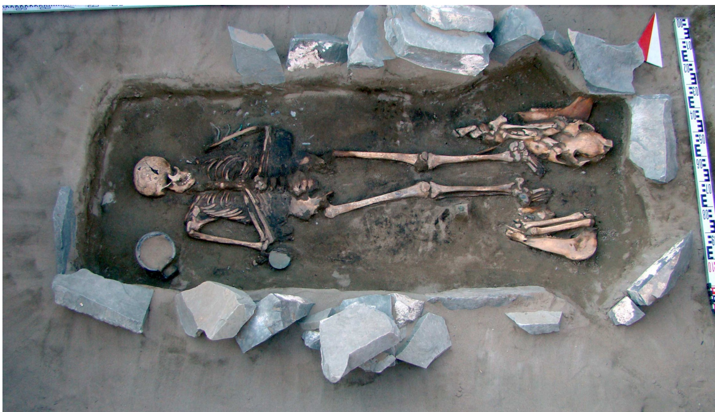
Fig. 45. Female grave AT1/47 with a horse skull, in a wooden coffin with stone siding.

Thus, in Tuva, the arrival of the Xiongnu or some tribe related to them culturally is reflected in the replacement of the Scythian-type Uyük-Saglyñ Culture by the Ulug-Khem Archaeological Culture. As a result, the characteristic Scythian-period fea-