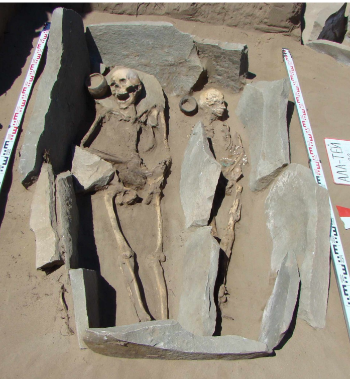
Fig. 47. A double female burial in a stone cist, AT1/23.

tion of grave inventory by gender. If in Scythian times in Tuva the more valuable objects were usually found in male burials, then in the Ulug-Khem Culture, they are in female burials. This could be evidence about the higher status of women in Xiongnu society than in the preceding Scythian society. However, the richer grave inventory of female burials might merely attest to the more beautiful ceremonial attire of women, which was natural for most nomadic and sedentary societies