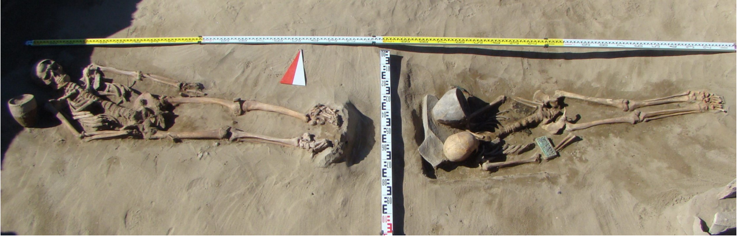
Fig. 46. Simple pit burials: male grave AT1/49 (on the left) and female grave AT1/50 on the right.

tures, such as collective burials in wooden chambers and the material culture associated with them, disappear. Mortuary monuments of different types appear: ordinary subterranean burials in stone cists, in wooden coffins or frames, simple earthen pit burials, and also large elite barrows with dromoses. The majority of the bodies are extended supine ones, though sometimes they are in the flexed position. The material culture corresponds entirely to that of the Xiongnu, including the most prominent examples of decorative applied arts, weaponry, ceramics, décor, and Chinese imports.