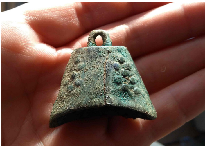
Fig. 17. A small bronze Chinese bell from a girl's grave AT1/91.

Belts with large plaque-buckles were most probably part of female ceremonial dress, possibly initially bridal, and subsequently worn only on special festive occasions and thus accompanying the owner into the world beyond the grave. The buckles made of jet, for example, are less sturdy than those made of bronze or bone; their frequent use quickly resulted in damage, which generally could not be repaired. Evidence of this is in the finds of pieces of such buckles, both in burials and in Xiongnu settlements. The jet buckles from Ala-Tey 1 and Terezin nonetheless show signs of wear.