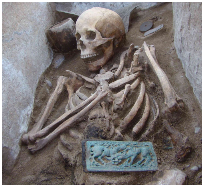
Fig. 14. Female grave AT1/42 with a bronze buckle depicting horses.