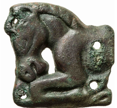
Fig. 27. A fragmentary bronze openwork buckle depicting a horse, from grave AT1/23.