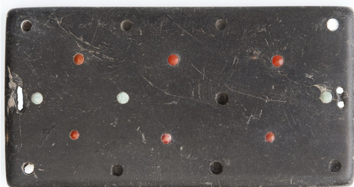
Fig. 31. A large jet buckle with inlay, from grave AT1/29.