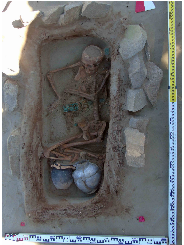
Fig. 48. Female burial T/31 in a wooden structure in a stone enclosure.