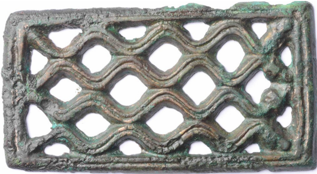
Fig. 21. A bronze openwork buckle depicting snakes, from grave AT1/43.