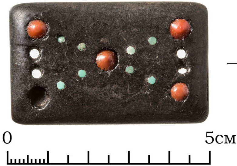
Fig. 35. A small jet belt plaque with inlay, from grave AT1/12.