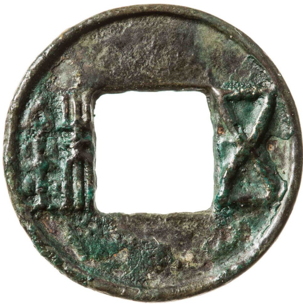
Fig. 16. A Chinese wuzhu 五銖 coin from the female grave AT1/29.

rated around the edges with open-work appliques of bronze, large and small bronze rings or stone disks, cowrie shells (or frequently their bronze imitations), bronze Chinese coins [Fig. 16], small bells [Fig. 17], and pendants of various materials [Fig. 18], sewn with beaded ornament. In every case, the belts were found in situ in the vicinity of the waist—that is they were worn and were definitely a part of the burial attire. In some Xiongnu cemeteries in Transbaikalia (Miniaev 2007, pls. 36, 90) or in northern China (Kost 2014: pls. 97, 99-100), analogous buckles sometimes are found at the feet or alongside the interred—i.e., the belt was not worn there but placed in the grave as a separate item of the burial inventory.