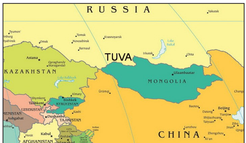
Fig. 1. Map of Inner Asia and Tuva.

Yet there are not so many traces of a Xiongnu presence in Tuva, on their probable route into the Minusinsk Basin. Exceptions are some chance finds (Kyzlasov 1969: 117-20; Savinov 1969: 104-8) and several excavated barrows of the Xiongnu elite in Central Tuva in the Bay-Dag 2 cemetery (Mandel'shtam and Stambul'nik 1992: 196-98). Unfortunately, the burials at Bay-Dag had been seriously looted in antiquity, and the materials from those excavations have yet to be published. The same is true of the materials of the very interesting Aimyrlyg XXXI cemetery, which is also located in Central Tuva (Stambul'nik 1983). The variety of the burials