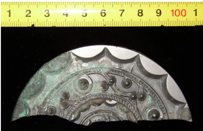
Fig. 36. A fragment of a Chinese mirror, chance find at Terezin.