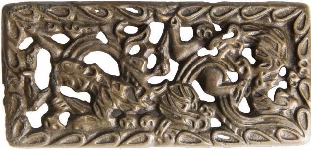
Fig. 20. A bronze openwork buckle from grave T/12.