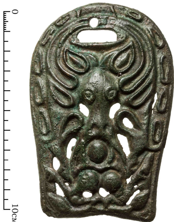
Fig. 19. A bronze openwork buckle depicting a bull from grave AT1/23.

We will briefly describe all of the types of large belt buckles found to date in the cemeteries of Ala-Tey 1 and Terezin: