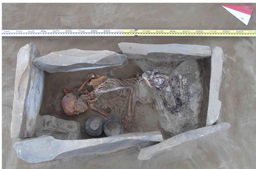
Fig. 7. The partially mummified burial of a young woman at Terezin (T/21).