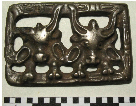
Fig. 25. A bronze openwork plaque depicting two bulls, from grave T/5.