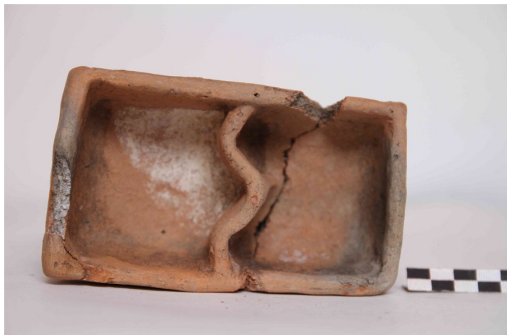
Fig. 43. A ceramic vessel/lamp with a partition, from the Ala-Tey 1 cemetery.

tery or gender. Both male and female burials were in stone cists [Fig. 44], wooden coffins with stone siding [Fig. 45], and in simple earthen pits [Fig. 46]. The depth of the graves also varied from literally 30 cm to 2 m. Male, female, and child burials were found with the body on the side or supine with flexed or extended legs. However, in the Ala-Tey 1 cemetery, the majority of the bodies were extended and supine (more than 90%), whereas in Terezin they had flexed legs [Figs. 47-48]. A distinctive feature of the extended male and female burials at Ala-Tey was the position of the arms: for