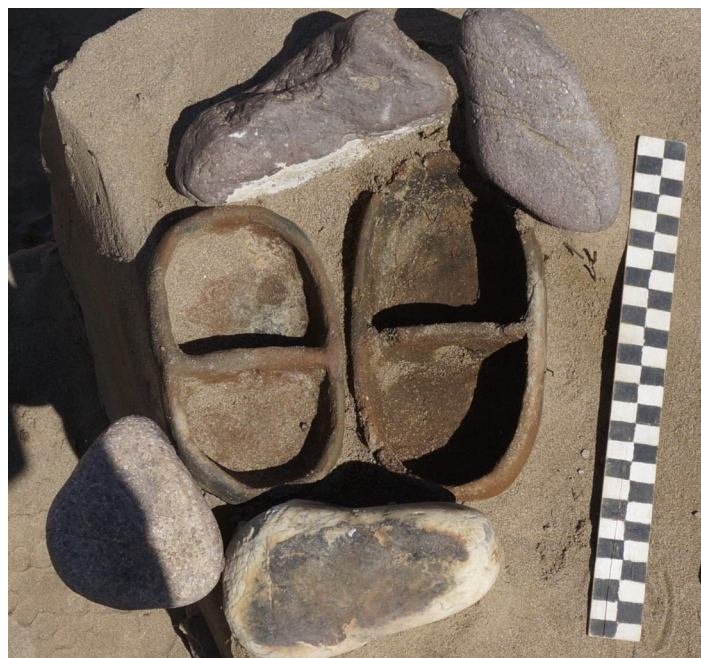
Fig. 42. Two ceramic vessels with a partition from grave AT1/72.

The male belts usually involved round or rectangular-framed iron buckles, some rather large, and also iron rings. A characteristic feature of a male belt also is the bronze spoon-like strap tip [Fig. 40], which is not found in female burials. While it may seem unusual, in male burials there are practically no weapons—in Terezin there were only two instances of burials of archers, which contained bone strengtheners for complex bows and arrowheads; at Ala-Tey, five graves contained bows and