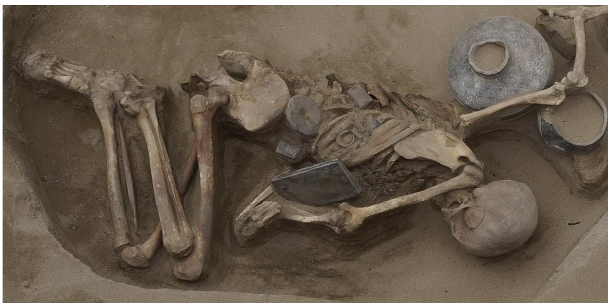
Fig. 33. The burial of an elderly woman whose belt comprised jet decorations, grave AT1/86.