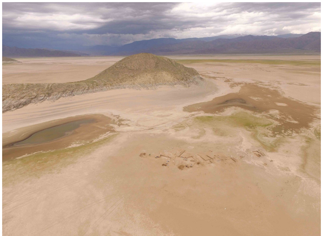
Fig. 3. The Ala-Tey cemetery.

The Ala-Tey 1 cemetery is located at the foot of a small mountain bearing the same name, which stands alone in a wide valley on the left bank of the