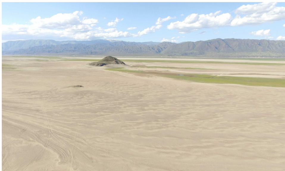
Fig. 4. The Ala-Tey mountain and cemetery at the beginning of June, before flooding.

The first excavations showed that we had found a unique, unlooted cemetery of the Xiongnu period, which both in its culture and chronology was identical with the Terezin cemetery that had been discovered slightly earlier. Since the Ala-Tey site was more compact, it was possible there to excavate over a broad area. Its discovery was a great achievement for archaeologists. The excavations of Ala-Tey have taken place in unusual conditions—since the mid-1980s, the site is located on the bottom of the Sayan-Shushenskoe reservoir. This means that work there is possible only during a brief period, usually 3-4 weeks a year in May to June, between the run-off from the cemetery of melt-water and its re-filling of the reservoir. During that period, the entire valley is like a desert [Fig. 4], but soon it fills up. During the rest of year the cemetery is at a