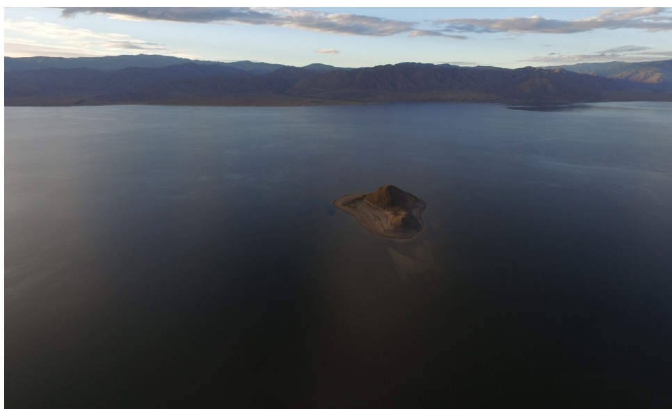
Fig. 5. The Ala-Tey mountain at the end of June, after flooding.

from them were found along 1.5 km of the shore, making it necessary to excavate large areas along the cliffs in the most promising places. This project was begun in 2018 with the participation of volunteers from the Russian Geographical Society, the result being that it has been possible to determine a definite structure of the cemetery and also find a large number of intact burials both from the