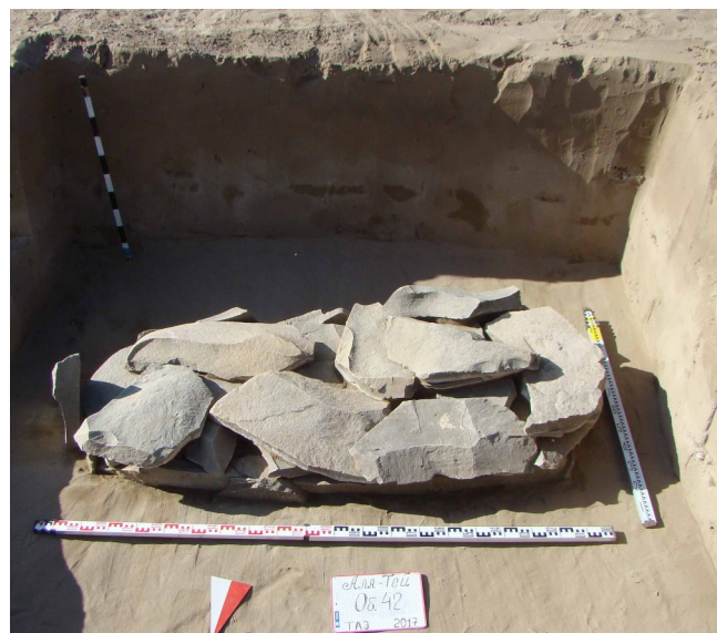
Fig. 44. The cover of stone cist AT1/42.

tery or gender. Both male and female burials were in stone cists [Fig. 44], wooden coffins with stone siding [Fig. 45], and in simple earthen pits [Fig. 46]. The depth of the graves also varied from literally 30 cm to 2 m. Male, female, and child burials were found with the body on the side or supine with flexed or extended legs. However, in the Ala-Tey 1 cemetery, the majority of the bodies were extended and supine (more than 90%), whereas in Terezin they had flexed legs [Figs. 47-48]. A distinctive feature of the extended male and female burials at Ala-Tey was the position of the arms: for