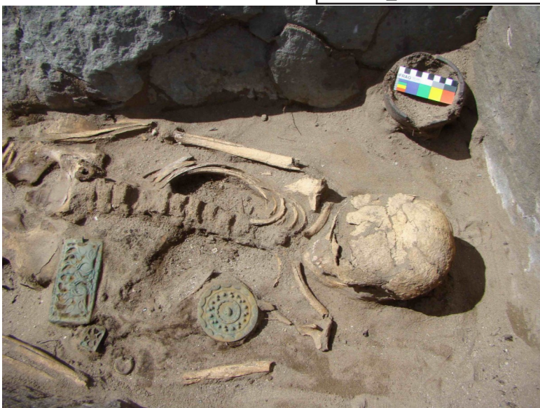
Fig. 13. Female grave AT1/11 with a Chinese mirror and bronze buckle.