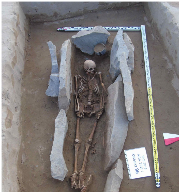
Fig. 11. The male burial of an archer AT1/96 in a stone cist.