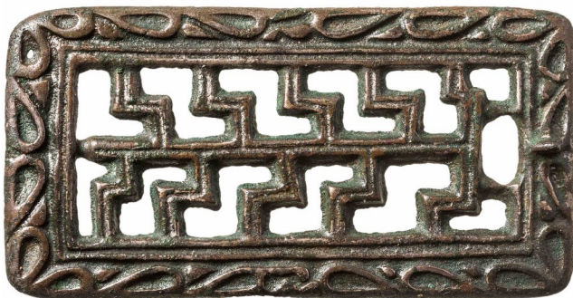
Fig. 23. A bronze openwork buckle with latticework ornament, from grave AT1/2.