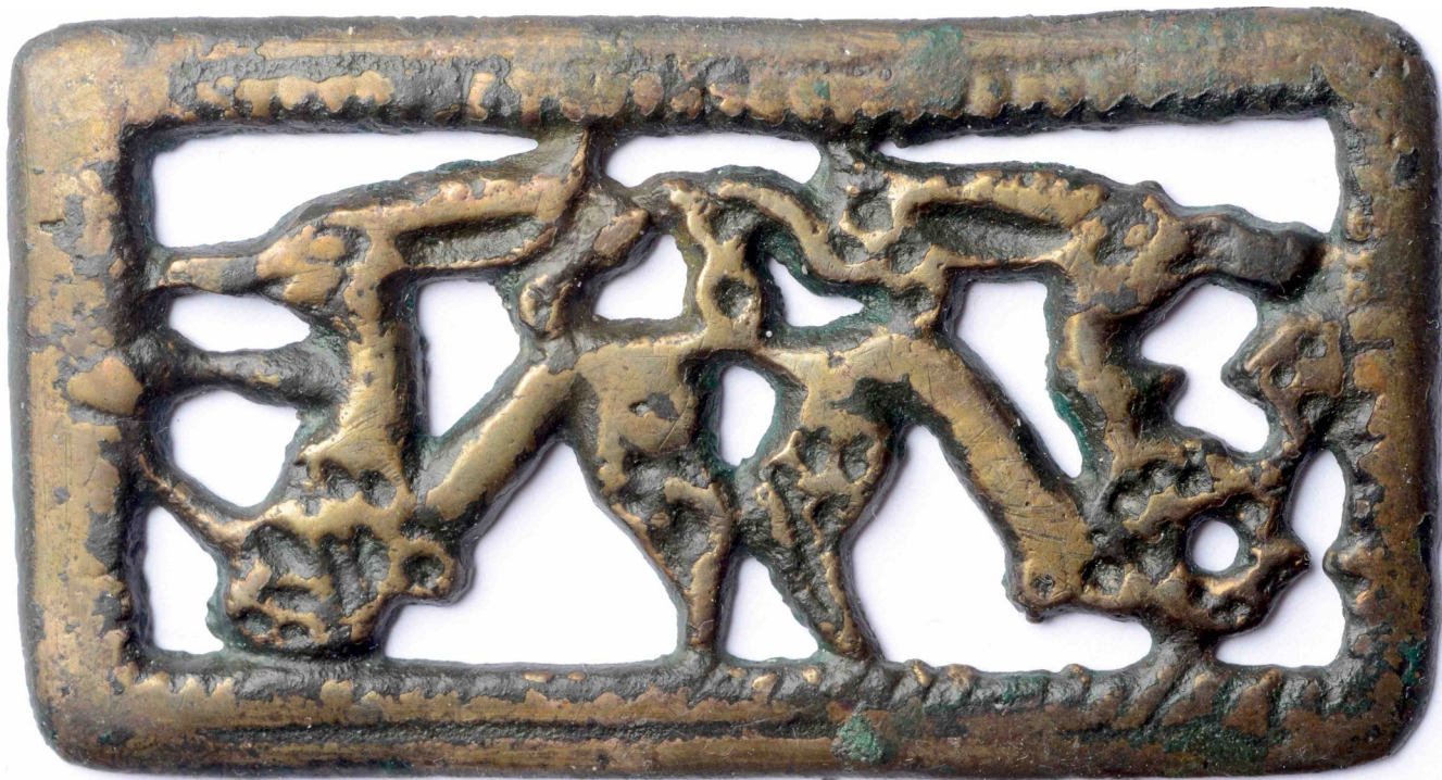
Fig. 29. A bronze openwork buckle (one of a pair) depicting two dragon-like creatures or Siberian ibex, from grave AT1/47.

Jet belt buckle plaques and appliqués previously had not been found in Tuva [Fig. 30]. In the Alatey 1 and Terezin cemeteries, large jet buckle plaques were found in five graves (AT1/29, 35, 86, T/21, T/23). The plaque from AT1/29 measures 18 x 9 cm [Fig. 31]. It is decorated with a dot pattern, the indentations with color inlay of turquoise, carnelian, and mother-of-pearl. The buckles from AT1/35 [Fig. 32] and T/23 are decorated in the same style. On the short sides of the buckle are