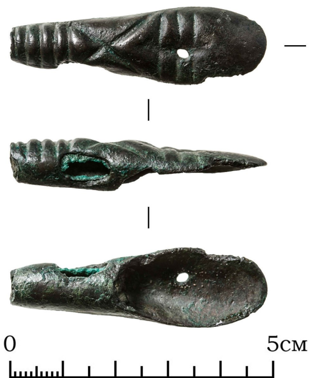
Fig. 40. A spoon-shaped strap tip from male burial AT1/49.

the Warring States Period, which in Tuva corresponds to the late Scythian period. For the most part, mirrors were found in rich burials with the openwork buckles, but occasionally in a grave with a rich composite belt there is no mirror. An important detail for the chronology of the monuments is the absence here of mirrors from the Eastern Han period (i.e., the 1st-2nd centuries CE), among them the widely distributed TLV mirrors.