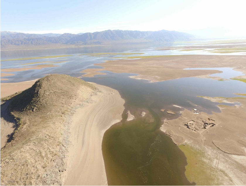
Fig. 9. The Ala-Tey 1 cemetery begins to be inundated by the Saian-Shushenskoe reservoir.

portrait of the population which left them, something that is impossible or only partly possible in most of the other cases.