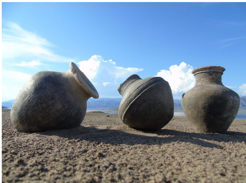
Fig. 41. Xiongnu ceramics from the Ala-Tey 1 cemetery.

the Warring States Period, which in Tuva corresponds to the late Scythian period. For the most part, mirrors were found in rich burials with the openwork buckles, but occasionally in a grave with a rich composite belt there is no mirror. An important detail for the chronology of the monuments is the absence here of mirrors from the Eastern Han period (i.e., the 1st-2nd centuries CE), among them the widely distributed TLV mirrors.