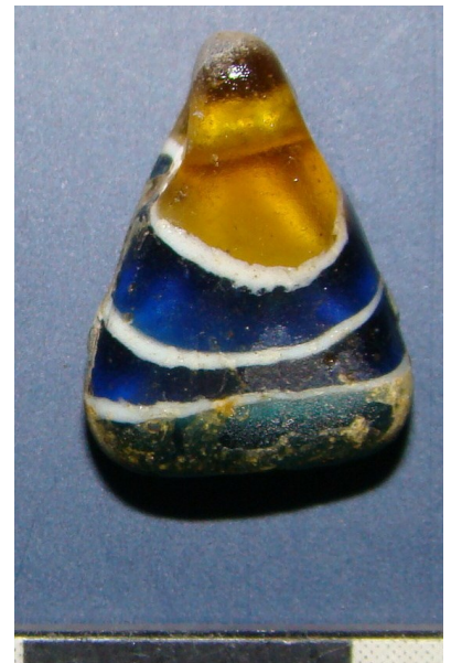
Fig. 18. A polychrome glass pendant from female grave T/9.

Belts with large plaque-buckles were most probably part of female ceremonial dress, possibly initially bridal, and subsequently worn only on special festive occasions and thus accompanying the owner into the world beyond the grave. The buckles made of jet, for example, are less sturdy than those made of bronze or bone; their frequent use quickly resulted in damage, which generally could not be repaired. Evidence of this is in the finds of pieces of such buckles, both in burials and in Xiongnu settlements. The jet buckles from Ala-Tey 1 and Terezin nonetheless show signs of wear.