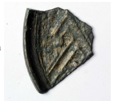
Fig. 39. A fragment of a Chinese mirror, from grave AT1/31.