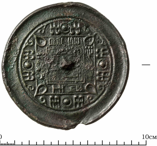
Fig. 37. A copy of a Chinese mirror with Chinese inscription, from grave AT1/25.