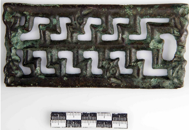
Fig. 22. A bronze openwork buckle with latticework ornament and animal heads, from grave T/5.