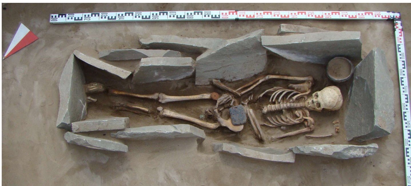
Fig. 30. A female grave with a jet buckle, AT1/35.

openings: on one side there are two round holes for securing the buckle to the belt; on the other a single, oval one, likely for the fastening of the buckle. In grave AT1/86 an aged woman had a complete composite jet belt [Fig. 33]—a large buckle plaque, rectangular appliqués, and a substantial ring. On the buckle was an interesting engraving depicting two walking mountain goats, with arrows falling on them. On the right are a bow and arrow, suggesting the presence of a bow-