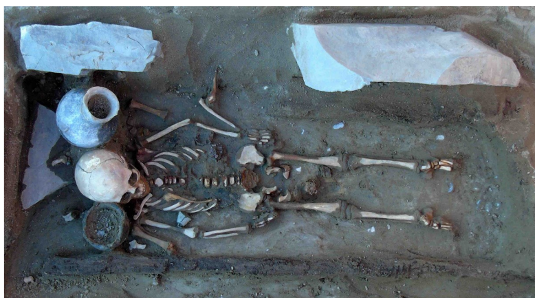
Fig. 50. A rich burial of a girl, AT1/91, in a wooden coffin (?) with stone siding.

await the archaeologists, discoveries which will help better to understand the historical processes occurring at that time in Inner Asia.